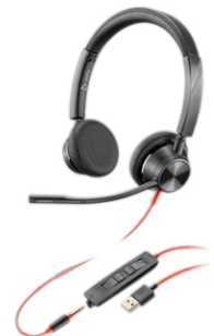
Blackwire 3300 Series (-M)