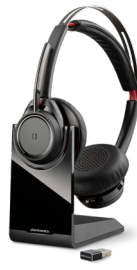
Voyager Focus UC