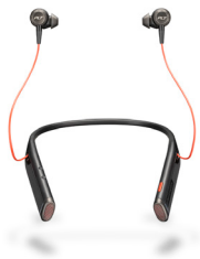
Voyager 6200 UC