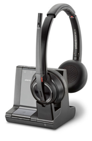
Savi 8200 Office UC Series