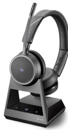
Voyager 4200 Office UC Series