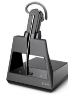
Voyager 4245 Office