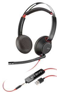
Blackwire 5200 Series