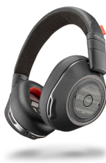
Voyager 8200 UC