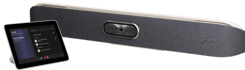
Poly Studio X50