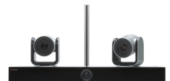
EagleEye Director II