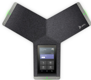
Poly Trio C60