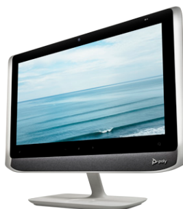
Poly Studio P21