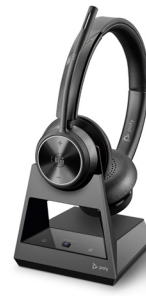
Savi 7300 Office Series