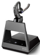
Voyager 5200 Office UC Series

The Blackwire family gives you a broad selection of corded UC devices that deliver outstanding audio quality and reliability, ease of use and price points to meet any budget.